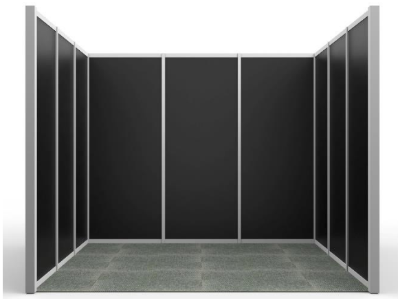
(c) 3 x 3m booth without crossbar fascia

All stands come with support structure and fascias as per diagrams (a) and (b)