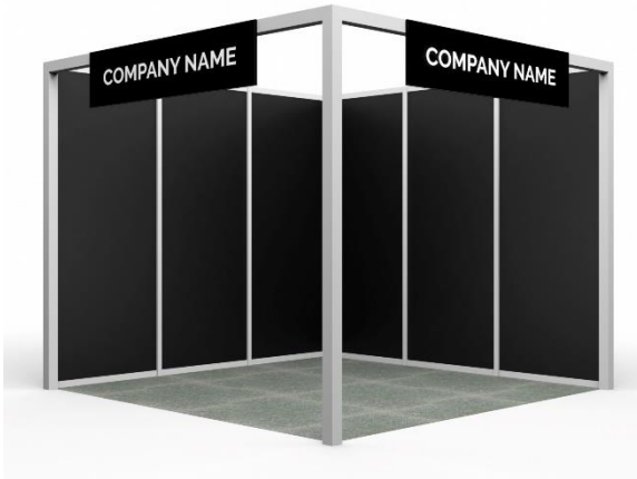
(a) 3 x 3m standard booth