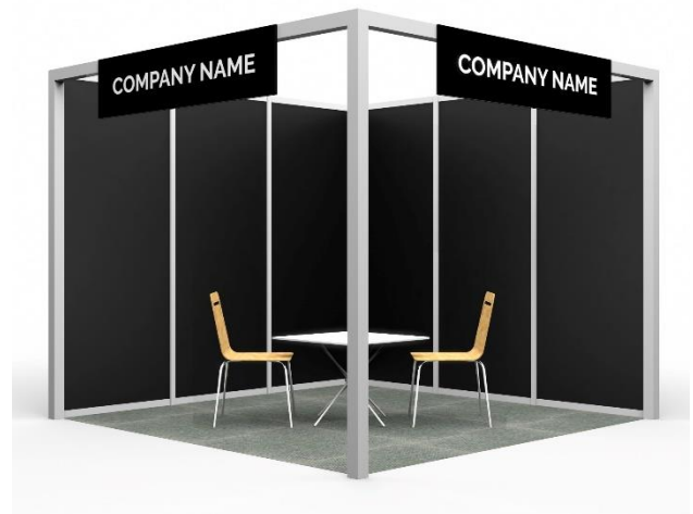
(d) Inclusive table and chairs option